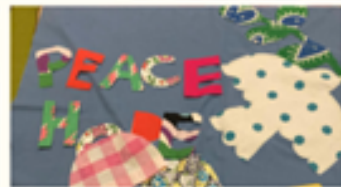
LET'S MAKE WONDERFUL THINGS TOGETHER

DROP IN | 6 TH JUNE | 10AM - 4PM HATHERLEIGH COMMUNITY CENTRE