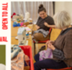
OPEN TO ALL