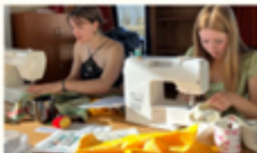
MAKE BANNERS FOR HATHERLEIGH FESTIVAL